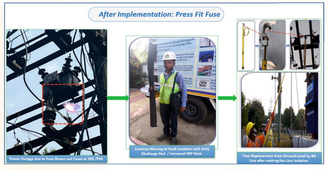
"Let's Prepare and prevent, don't repair and repent ..."