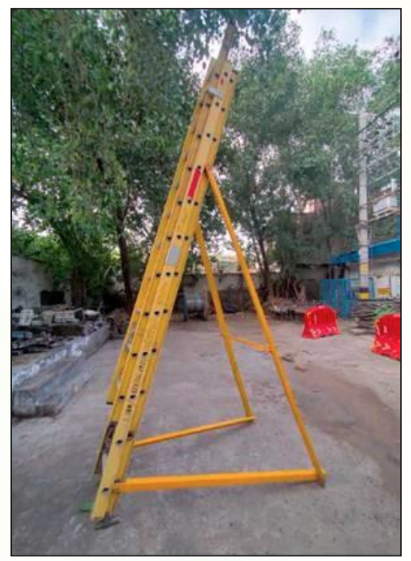
Self Supporting Ladder

Efficient ladder designs consider the ergonomics of workers. Traditional ladder designs often lacked comfort features, leading to fatigue and increased risk of accidents. Modern ladder designs incorporate features such as anti-slip rungs, comfortable handholds, and adjustable heights to minimize strain on workers'